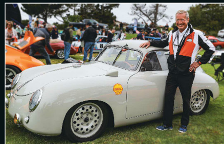
Werks Reunion welcomes Porsche enthusiasts of all types, including such notables as multiple Le Mans- and Daytona-winning driver Hurley Haywood, pictured at left with Pikes Peak veteran Fred Veitch's Fashion Grey 1953 356 Gesetzloser.