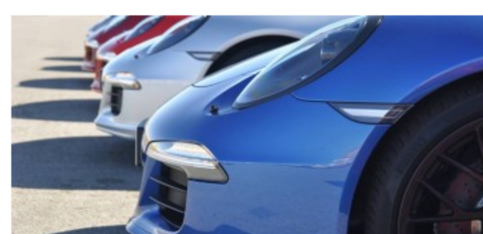
10 Things We Learned Driving Porsche's New 991 GT3