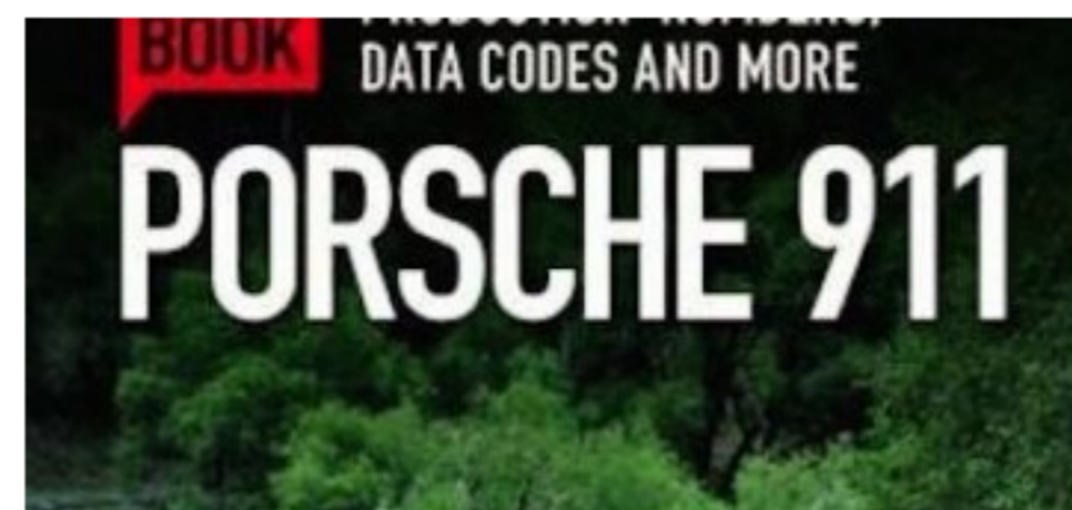
Porsche 911 Red Book 3rd Edition