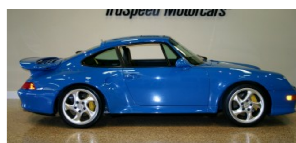
Jerry Seinfeld's 1997 Porsche 993 Turbo S