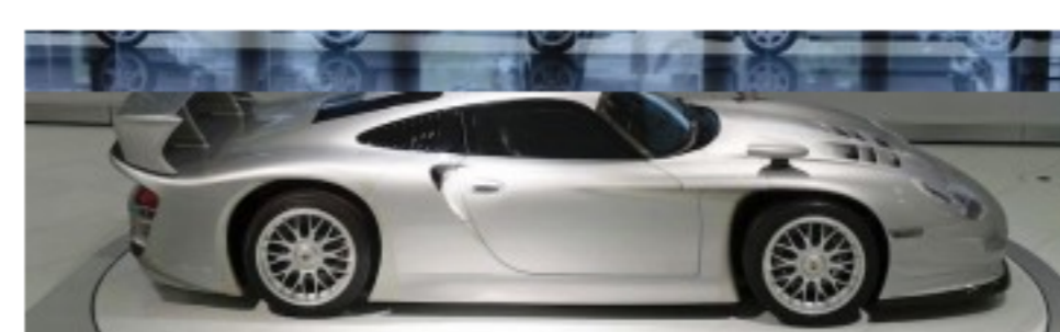
7 Porsche "Supercars" From 7 Different Decades