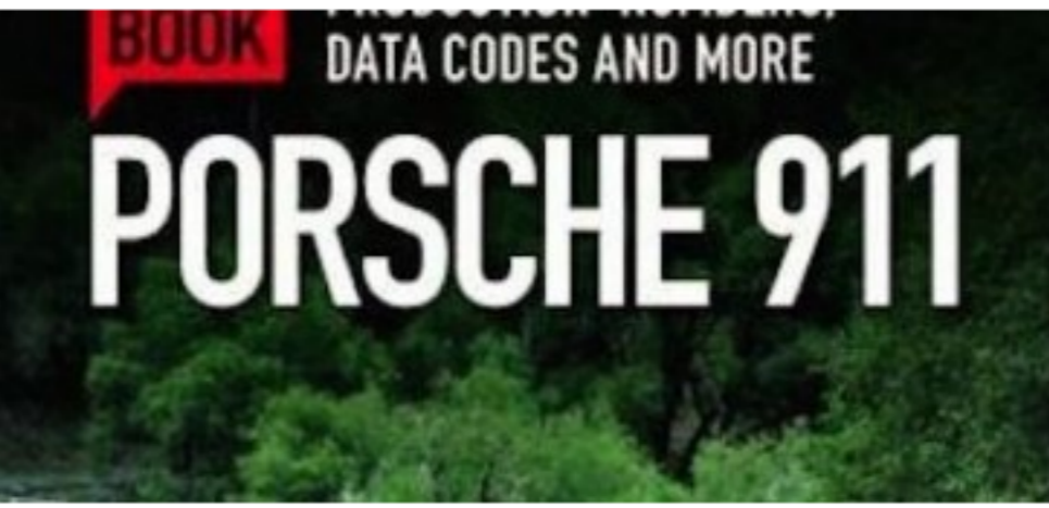
Porsche 911 Red Book 3rd Edition