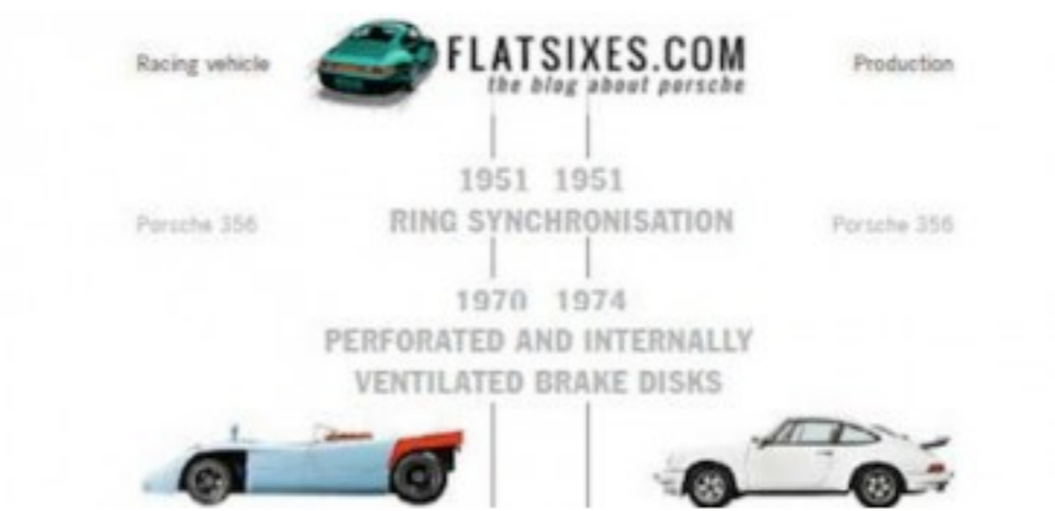
10 Pieces Of Porsche Technology That Transferred From The Race Track To The Road