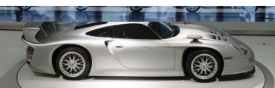
7 Porsche "Supercars" From 7 Different Decades