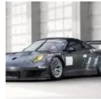
Falken Tire Secures New 911 RSR, Starting TUDOR USCC 2014 With Sebring 12 Hour