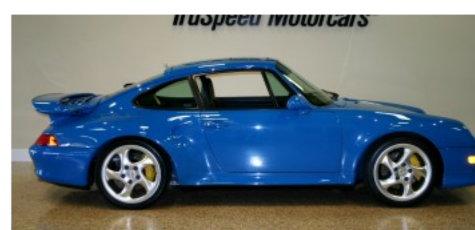
Jerry Seinfeld's 1997 Porsche 993 Turbo S