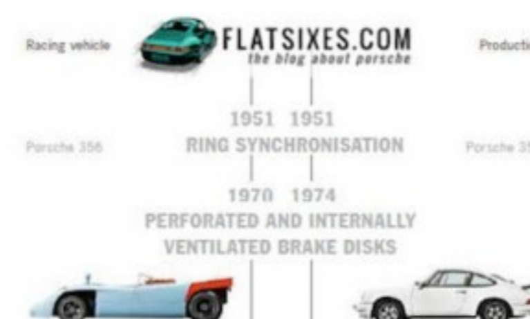
10 Pieces Of Porsche Technology That Transferred From The Race Track To The Road