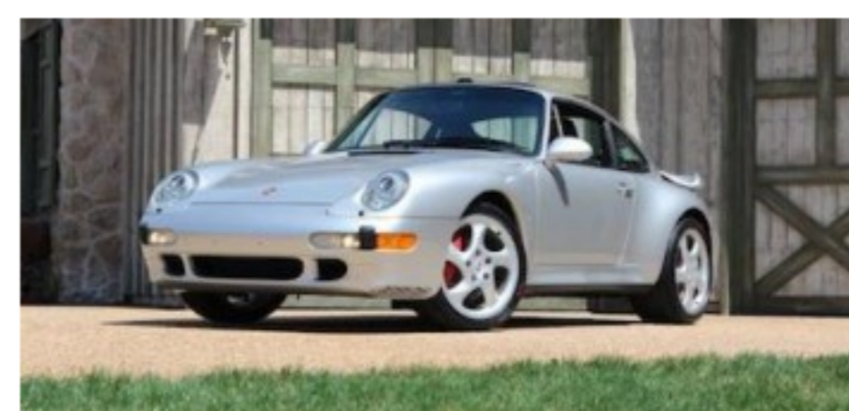
The New Reality Of The 993 Turbo Market