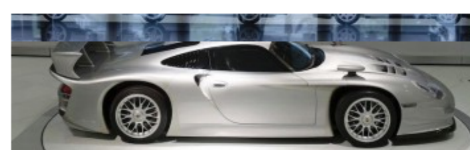
7 Porsche "Supercars" From 7 Different Decades