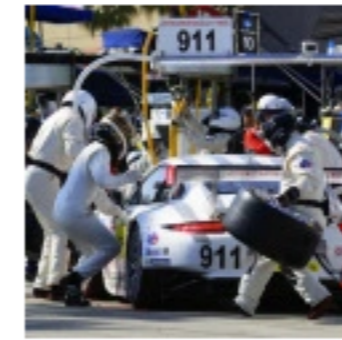
Porsche's Results And Pictures In The Tudor USCC At Long Beach