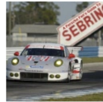
A Porsche Fan's Guide To The 2015 Mobil 1 Twelve Hours Of Sebring