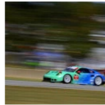
Porsche's Results And Pictures At Petit Le Mans