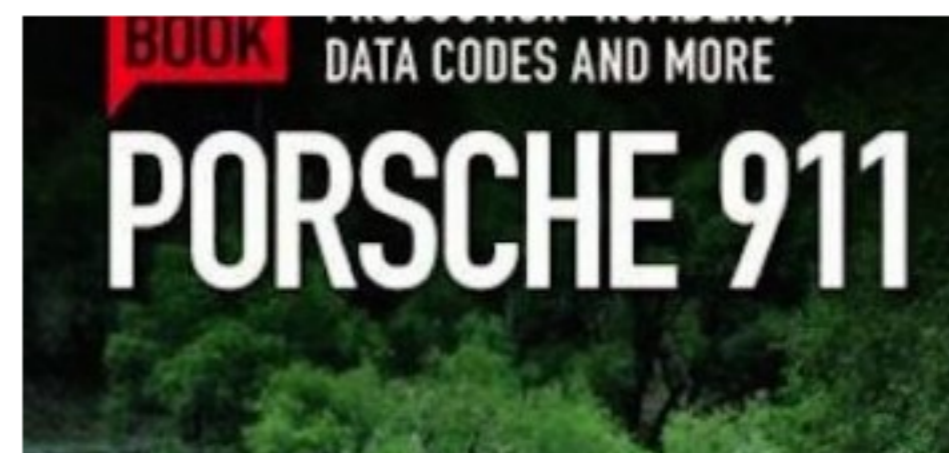
Porsche 911 Red Book 3rd Edition