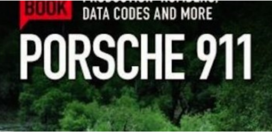
Porsche 911 Red Book 3rd Edition