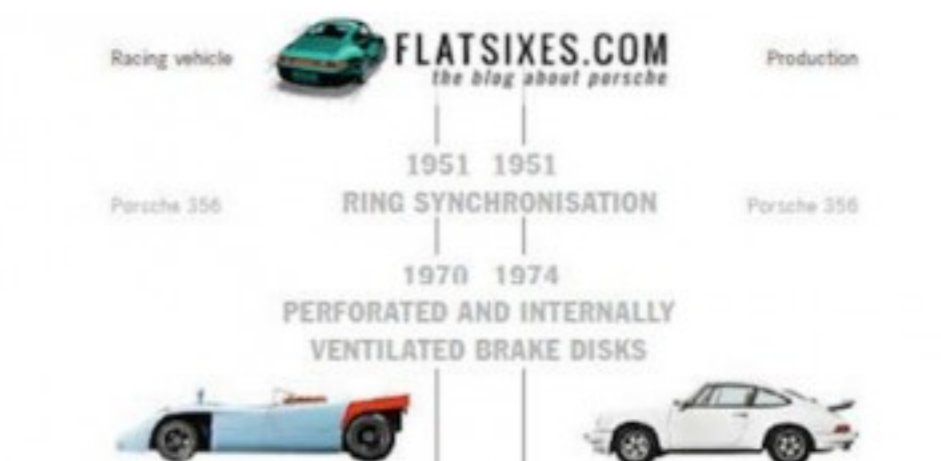
10 Pieces Of Porsche Technology That Transferred From The Race Track To The Road