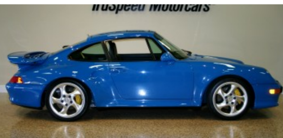
Jerry Seinfeld's 1997 Porsche 993 Turbo S