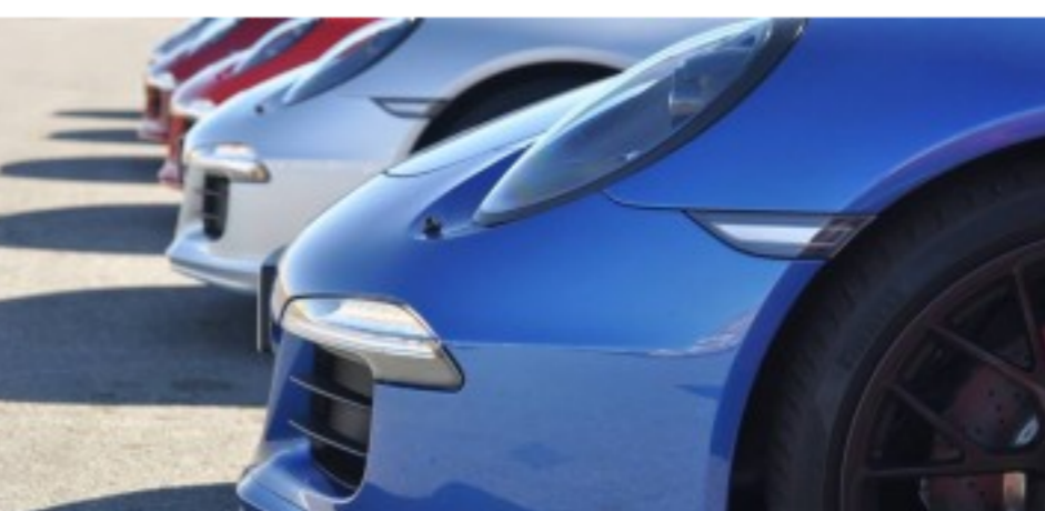
10 Things We Learned Driving Porsche's New 991 GT3