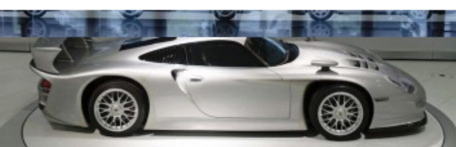
7 Porsche "Supercars" From 7 Different Decades