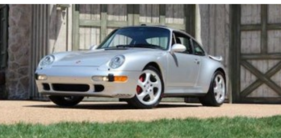
The New Reality Of The 993 Turbo Market