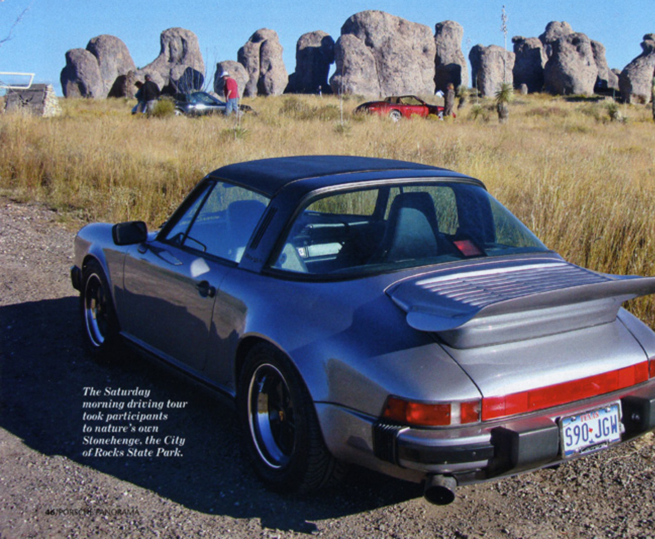
The Saturday morning driving tour took participants to nature's own Stonehenge, the City of Rocks State Park.

The late October event, which just celebrated its 35th edition, brings in a strong contingent of PCAers from Arizona, New Mexico, and Texas for two and half days of